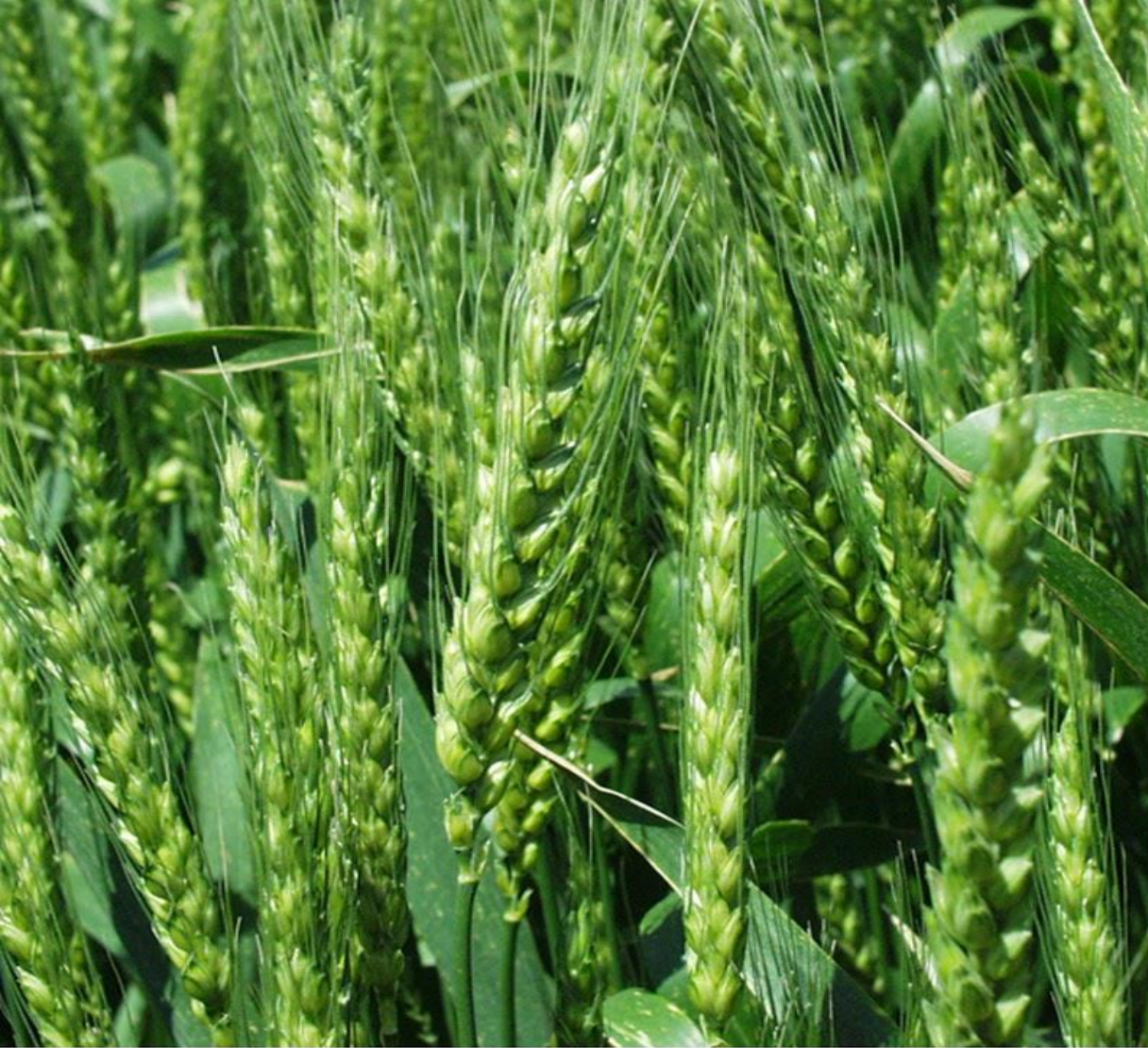
WHEAT: before it is fully ripe.