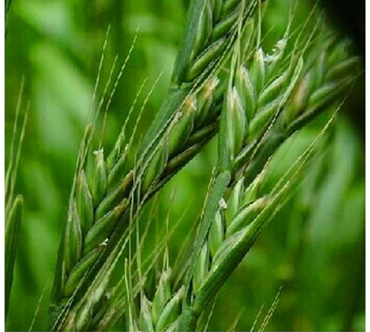
TARES: Lolium Temulentum